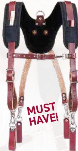
Stronghold® Suspension System