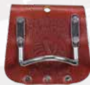
High Mount Hammer Holder