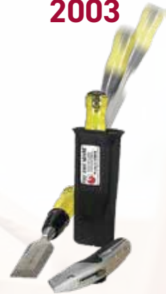
Oxy™ Tool Shield