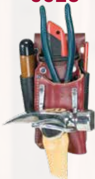
5-in-1 Tool Holder