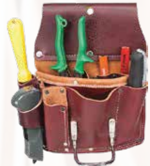
PRO Drywall™ Pouch