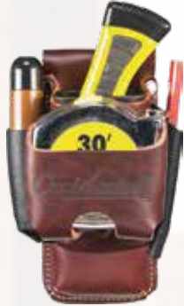
Belt Worn 4-in-1 Tool/Tape Holder